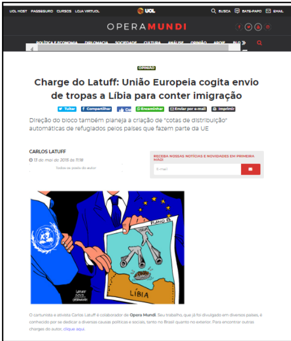
Figure 3: Published on May 13, 2015 9