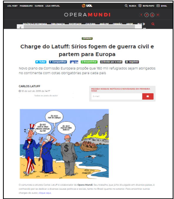
Figure 4: Published on September 10, 2015 10