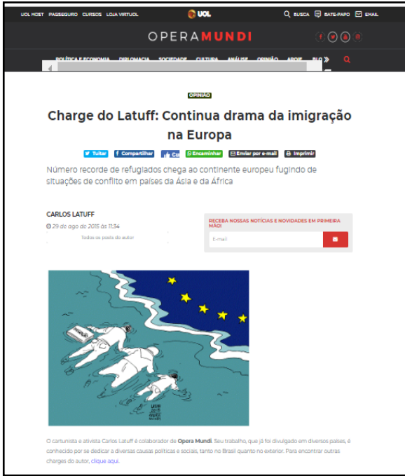
Figure 2: Published on August 29, 2015 8