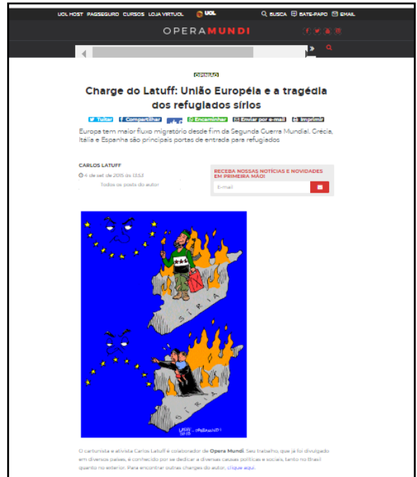
Figure 5: Published on September 4, 2015 11