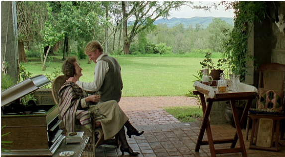
Pic. 2: Karen (Meryl Streep) and Denys (Robert Redford) in Out of Africa (1985)

realize her deeper engagement with Africa and her people and her profound but schizoid relationship with them of love for their pristine land and obedience and apprehensions regarding their free spirit and defiance, as epitomized by her attraction and repulsion toward Denys, his whiteness offering her the security she seeks as a lonely and loveless woman in a foreign land but his raw and wild spirit of adventure and unwillingness to be tamed by the ritual of marriage undermining any such solace.