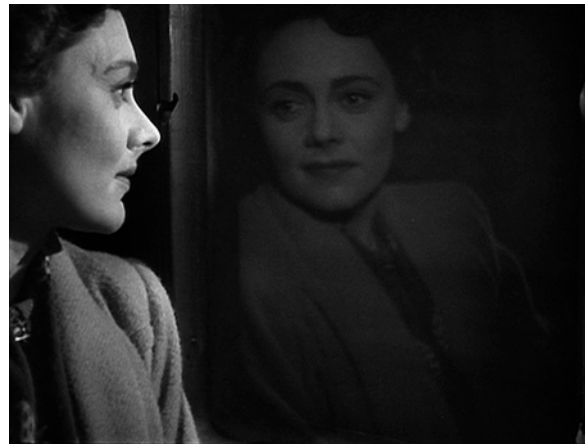
Pic. 5: Laura' double/interiority in Brief Encounter (1945)

another, but is specifically Laura's telling of it." 7 As far as the music is concerned, Rachmaninov and Laura are juxtaposed together. Thus, the piano concerto we hear during the credits later becomes her theme, as it first enters with a gradual attack inside the train sequence, while the camera tracks into her close-up and her voice-over begins in the film for the first time. The texture of Laura's voice over is thus laid like an embroidery, rather than using the voiceover as the normative patchwork: Laura's anxiety and her inner "blues" are woven together with Rachmaninov's velvety romantic tunes to embroider the striation in her very smooth middleclass sedentary life.