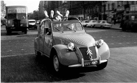
Pic. 7: Chris Marker's Le Joli Mai (1963): The Happy and Cheerful Month of May