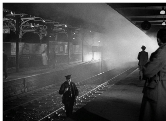
Pic. 4: Alec (Trevor Howard) watching Laura (Celia Johnson) at the Milford Railway Station in Brief Encounter (1945)

Since Laura's confessions do not appear as a continuous pouring from her heart, at a certain point of time in the story, but rather, as streams of guilt interspersed with delicate adventures, negotiating the voice-over as it encapsulates the various segments of this story poses a challenge. The sound track is therefore carefully designed by favoring the voice-over in sound balance, as is normally done in films, and also at the same time, making it unique by using a romantic Rachmaninov piano theme. The generic sounds of traffic on the busy Milford street by day, along with the familiar soundscape of Milford railway station by night, are effectively used to create a romantic out-of-focus sound frame that carefully layers the anxiety ridden, guilt-filled, and sometimes hysterical, voice-overs.