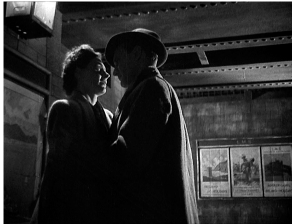
Pic. 6: Laura (Celia Johnson) and Alec (Trevor Howard) in Brief Encounter (1945)

passion, and thus smoothen her disconnected heart and its longings. Thus, the textural embroidery surrounding Laura’s passionate but anxiety ridden voice underpins this classic narrative of the flow desires between the subconscious/striated and the conscious/smooth.