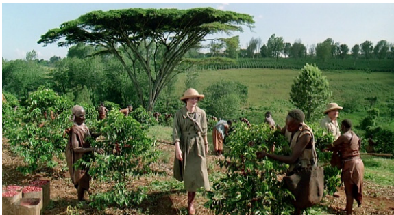
Pic. 1: Karen (Meryl Streep) in Out of Africa (1985)